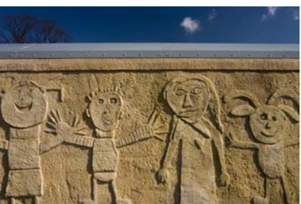
One of the bridge murals designed by the local community

BAM Nuttall Ltd St James House, Knoll Road, Camberley, Surrey. GU15 3XW